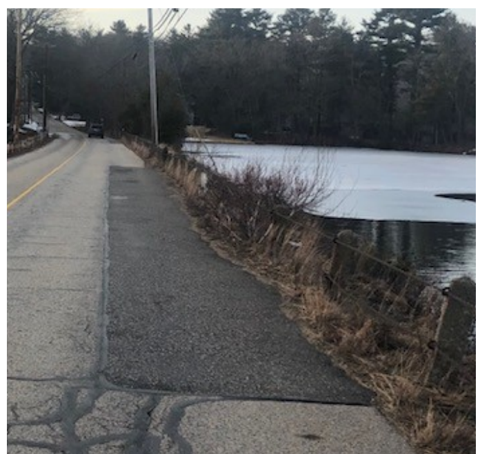
Page 4 of 12

The picture on the right shows one of four repair patches where the water over the causeway washed part of it away. The material which was washed away was filled-